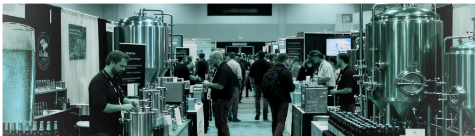
EXHIBIT / SPONSOR

Modern Brewing, Timeless Fundamentals Submit Your Abstract Today!